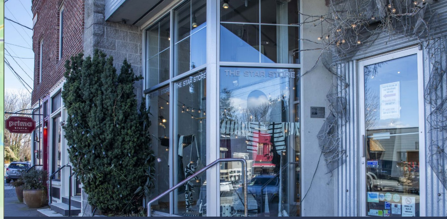
Learn more at visitlangley.com/businesses